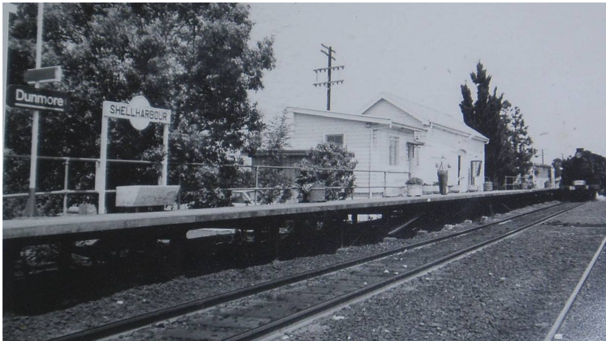
Original weatherboard buildings, platform 2

Dunmore station closed on 21 November 2014 , being replaced by Shellharbour Junction station , located 800 metres to the north.